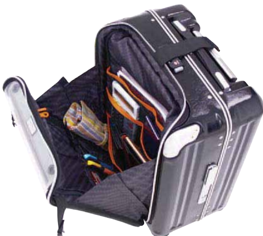
Front pocket wide opened view

* The sheet specifications are under isolated situation. It may change under different conditions, please note that.